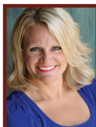
Cindra Kamphoff Mentally Strong Institute