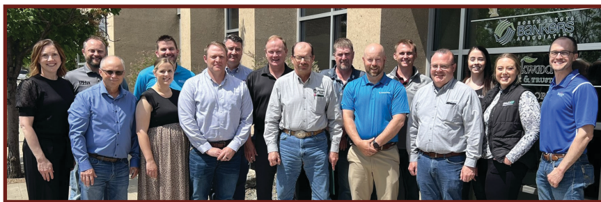
NDBA Ag Committee