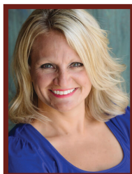
Cindra Kamphoff Mentally Strong Institute